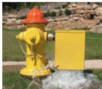
#9700 Automatic Hydrant Flusher