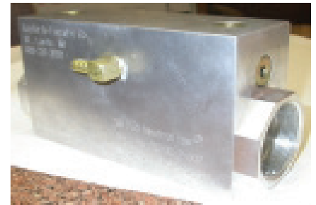
For Dechlorination, We Furnish The BEST From Measurement Technologies!