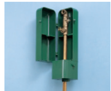
#88WC Bacteriological Sampling Station