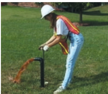
#TF550 Valve Box Blow-Off