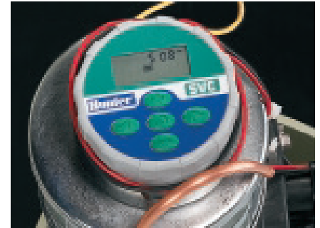
Controller Capable of Nine Flashes Per Day! Operates with 9 Volt Battery

AUTOMATIC FLUSHING DEVICE SHALL HAVE A 2" BRASS MIP INLET, LEADING VERTICALLY THROUGH A UV RESISTANT GROUND PLATE, A MOUNTING FLANGE, AND ATTACHING TO A PLASTIC SCH 80 TRAFFIC BREAK-AWAY COUPLING. A 2" ALUMINUM QUICK DISCONNECT DEVICE SHALL BE LOCATED ABOVE THE TRAFFIC COUPLING, LEADING INTO THE 2" AUTOMATIC VALVE. AUTOMATIC SOLENOID VALVE SHALL BE LOCATED ABOVE GROUND FOR EASY ACCESS, HAVE INTERNAL, SELF-CLEANING DEBRIS SCREEN, AND HAVE A 220 PSI RATING. VALVE CONTROLLER WILL NOT REQUIRE A SECOND HAND-HELD DEVICE FOR PROGRAMMING, MUST HAVE A MINIMUM OF 9 POSSIBLE FLUSHING CYCLES PER DAY, SHALL BE SUBMERSIBLE TO 12 FEET, OPERATE WITH A 9 VOLT BATTERY, HAVE RESIN-SEALED ELECTRICAL COMPONENTS, AND SHALL BE LOCATED ABOVE WATER FLOW. SOLENOID SHALL HAVE NO LOOSE PARTS WHEN REMOVED FROM VALVE. VALVE, SOLENOID, AND CONTROLLER SHALL HAVE RUBBER CAPS FOR ADDED PROTECTION. EACH UNIT SHALL HAVE A DOUBLE-VALVE, ALL BRASS SAMPLING POINT. WATER SHALL EXIT UNIT HORIZONTALLY THROUGH HOLES LOCATED NEAR GROUNDLINE. ALL ABOVE-GROUND COMPONENTS SHALL BE CONTAINED WITHIN A UV-RESISTANT LOCKING DOMED COVER, AS MANUFACTURED BY KUPFERLE FOUNDRY COMPANY, ST. LOUIS, MO , 1-800-231-3990, OR APPROVED EQUAL.